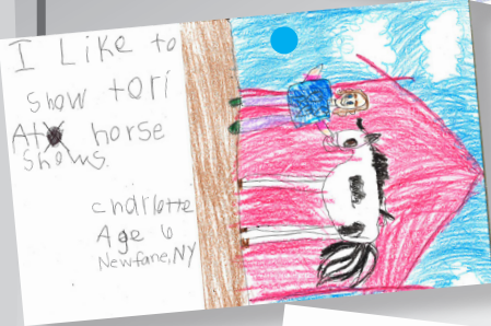
CHARLOTTE, AGE 6 ONTARIO SHORES FCU